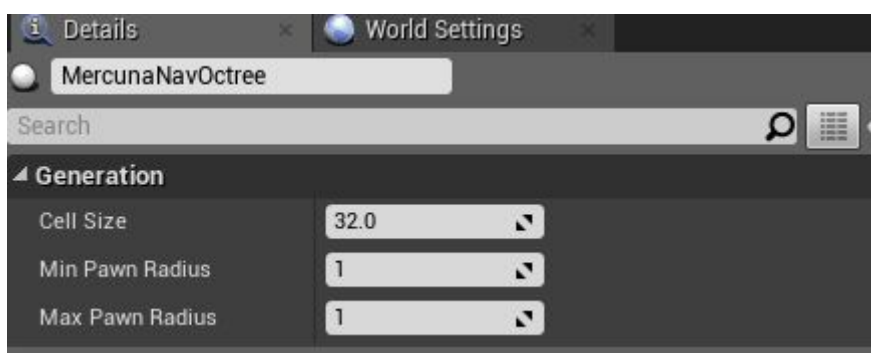
Example settings for Mercuna Nav Octree

The octree generation parameters to be used in this level are configured on the Mercuna Nav Octree actor. Upon creation, the parameters are set to default values. These defaults can be modified in the Mercuna project settings.