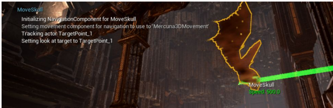
Onscreen logging and information available about the debug actor

On screen log messages will be displayed for the Mercuna debug actor and additional debug draw is available.