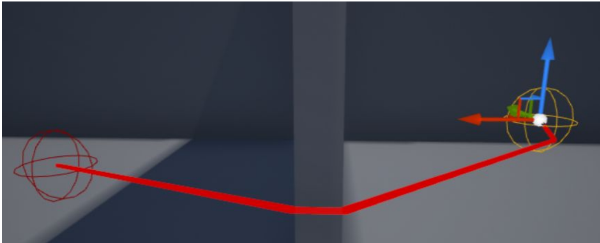
A test path between two Mercuna Nav Testing Actors

The Radius property specifies how much clearance there should be around the test path - this allows you to check what path larger and smaller actors would take.